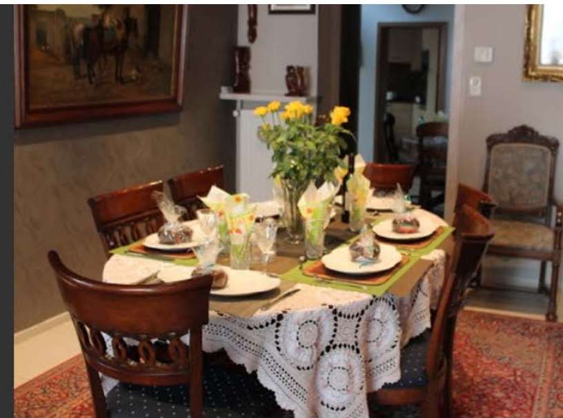
Ontbijt tafel - Table de petit-déjeuner - Frühstückstisch - Breakfast table